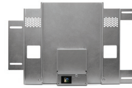
450MM & 600MM WALL BRACKETS

Enphase AC Battery™ with integrated S270 Micro, 270W/1.2 kWh, 230 VAC indoor IP20 rated. Also compatible with grid-tied PV systems using the Enphase Envoy.