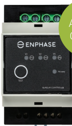
Q RELAY THREE PHASE

Relay controller for voltage/frequency compliance for single phase systems.