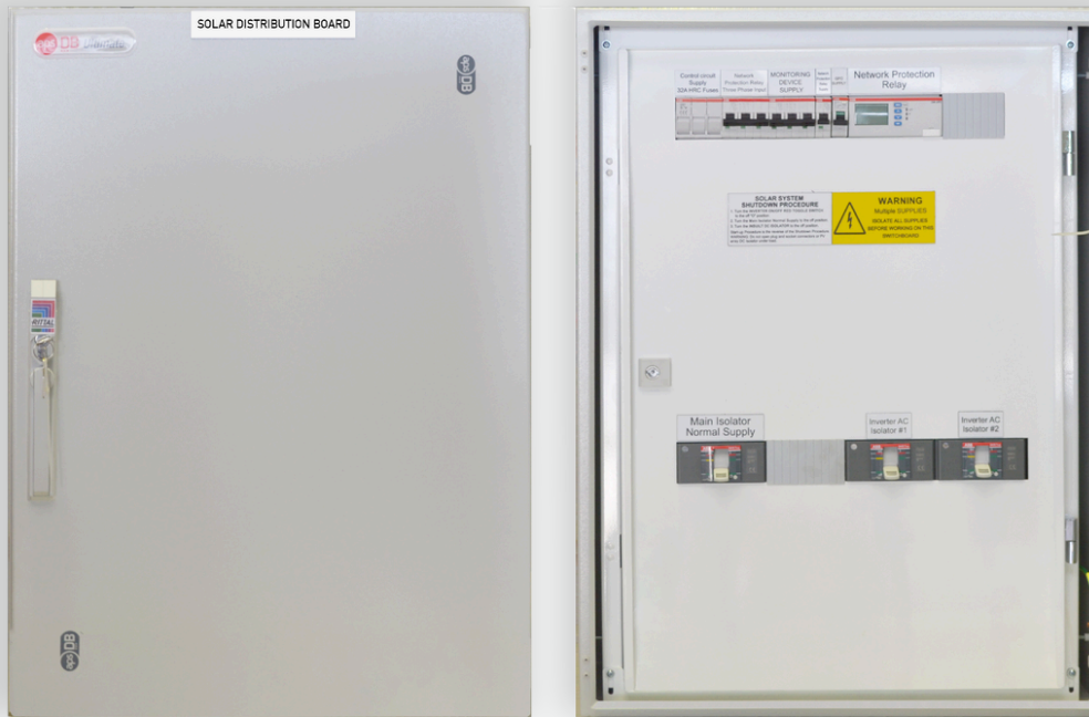
Image is indicative only, Model may differ from image while maintaining functionality.