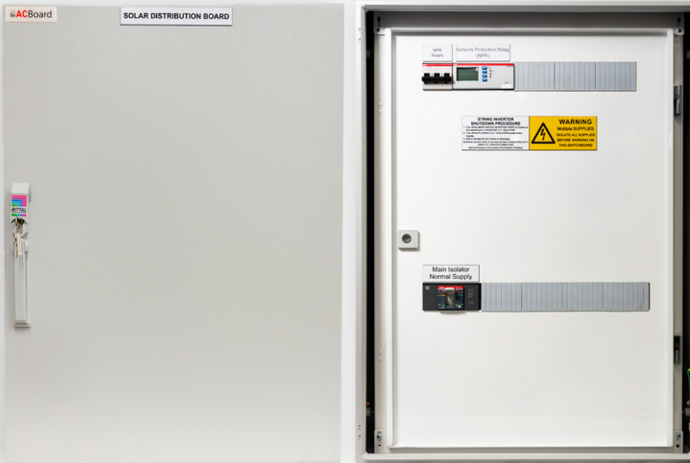
Image is indicative only, Model may differ from image while maintaining functionality.